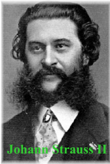
Johann Strauss II

Featuring Weber Invitation To the Dance Handel Water Music Mozart Minuet from Symphony No. 41 (Jupiter) Bizet Carmen Suite No. 2 Strauss Blue Danube Waltz Bernstein West Side Story Selections Leroy Anderson Christmas Festival & Sleigh Ride Handel Messiah Excerpts